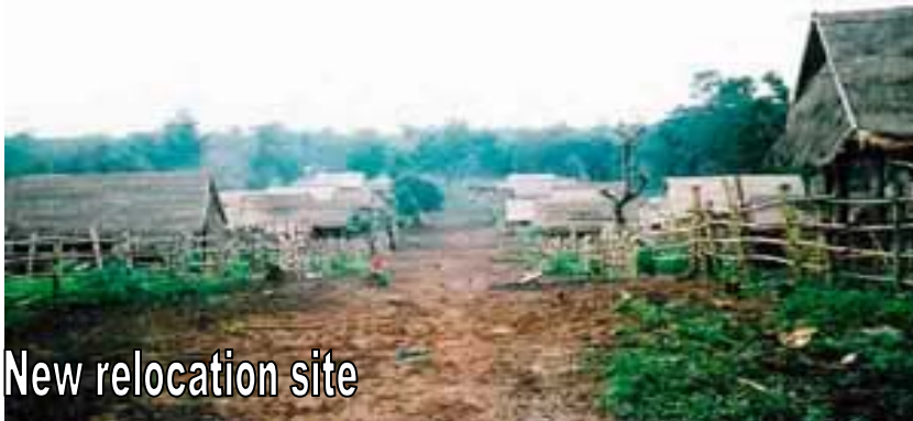
New relocation site

In May 2004, several villages in Nong Kaw tract of Laikha which had already been relocated several times since 1996 were forced by SPDC troops to move again, within 5 days. At their new site, they have once again had to rebuild their houses and clear land for farming.